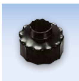
Shrink cap MK