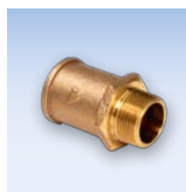
Fix point MFP

Fix points must be installed to absorb the possible effects of thermal expansion / shrinkage of the PE-Xa transport pipes.